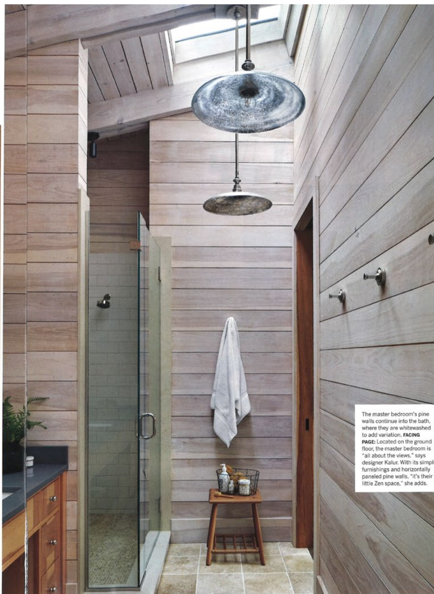
The master bedroom's pine walls continue into the bath, where they are whitewashed to add variation. FACING PAGE: Located on the ground floor, the master bedroom is "all about the views," says designer Kalur. With its simple furnishings and horizontally paneled pine walls, "it's their little Zen space," she adds.